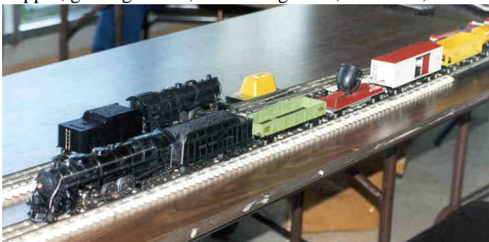
The layout in action

On the layout, Kid's Club member, Darrell Calvillo ran a Gilbert 3/16 'O' gauge #570 Hudson followed by a yellow hopper, green gondola, a searchlight car, a box car, a Shell