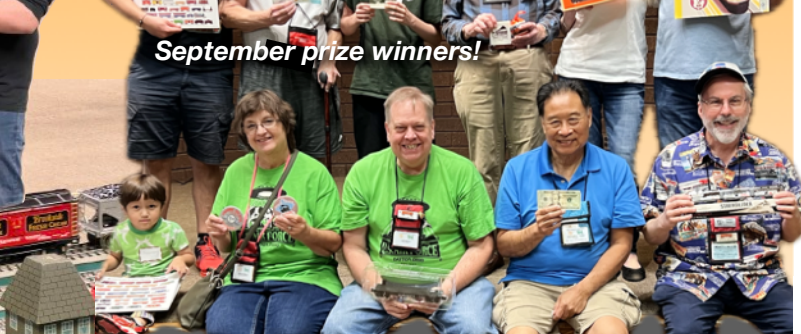
September prize winners!