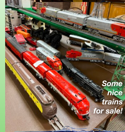
Some nice trains for sale!