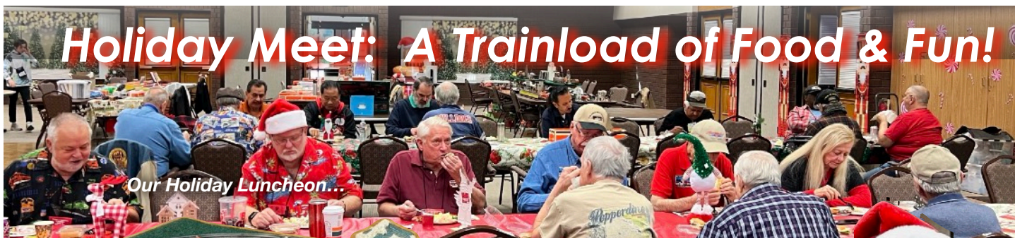
Our Holiday Luncheon...