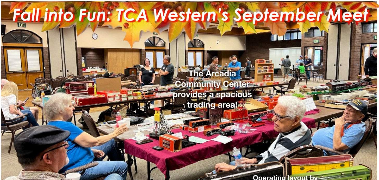
The Arcadia Community Center provides a spacious trading area!