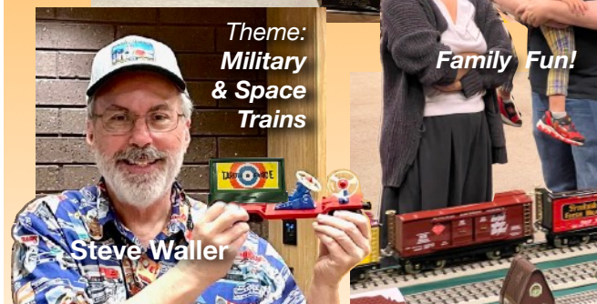
Theme: Military & Space Trains