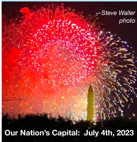
Our Nation's Capital: July 4th, 2023

July 22 - Arcadia Community Center 365 Campus Drive Arcadia, CA 91007 Theme: Made in the USA. 9 am - 2 pm.