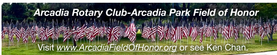
Arcadia Rotary Club-Arcadia Park Field of Honor

Our Arcadia Meets will feature a LIONEL test track, train layouts, a repair service, refreshments, opportunity drawings and an auction. Selling tables are for TCA Western members only. To reserve a free selling table, please send an email to info@tcawestern.org . All our remaining 2023 Meets will be at the Arcadia Community Center. We look forward to seeing you!