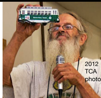
2012 TCA photo