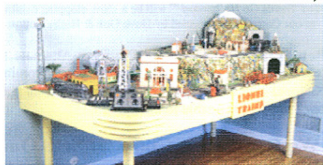
TCA member Rob Likani of Arcadia will bring a portable layout to our Convention in Ontario. What have you?