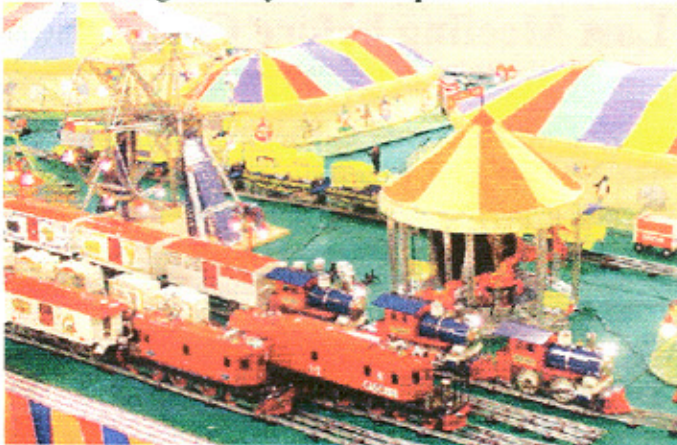
The Nissen Family Circus will be a highlight at the Toy Train Expo at the Ontario Convention Center. Please volunteer!

Heard the news? We're hosting a Convention in June! That was the hot topic at last month's meet. Besides the members-only Trading Pit in the Ontario Convention Center's Hall "A", we will invite the public to a free event in Hall "B" that we're calling the Toy Train Expo!