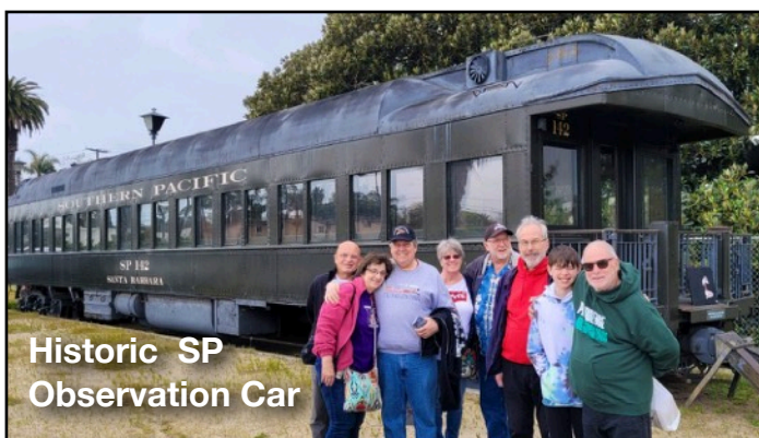
Historic SP Observation Car

Our Amtrak Pacific Surfliner Excursion to Santa Barbara on March 12th was fantastic! Just traveling along the coast was so serene and beautiful. The restaurant had an outstanding seafood menu.