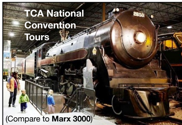
(Compare to Marx 3000)

Can you believe it is already May, 2023? On May 20th we will have our last train show at the Joslyn Adult Center in Burbank. Next month, it's onward to the spacious Arcadia Community Center. This hall is much larger than any of our previous locations. We'll meet there for the rest of 2023.