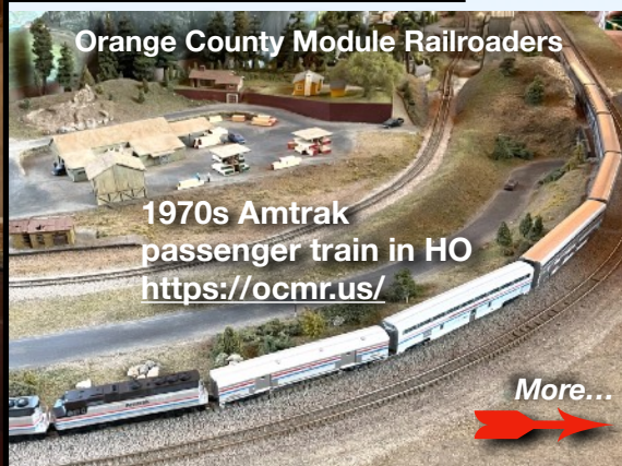
Orange County Module Railroaders

1970s Amtrak passenger train in HO https://ocmr.us/