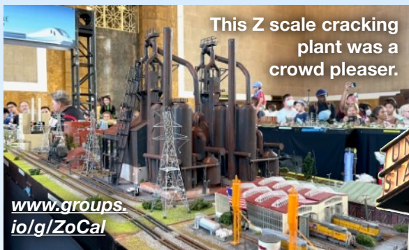
This Z scale cracking plant was a crowd pleaser.