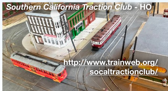
Southern California Traction Club - HO

http://www.trainweb.org/socaltractionclub/