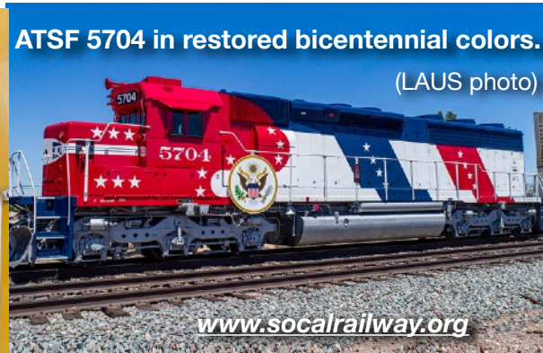
ATSF 5704 in restored bicentennial colors.