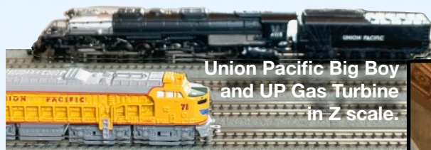
Union Pacific Big Boy and UP Gas Turbine in Z scale.