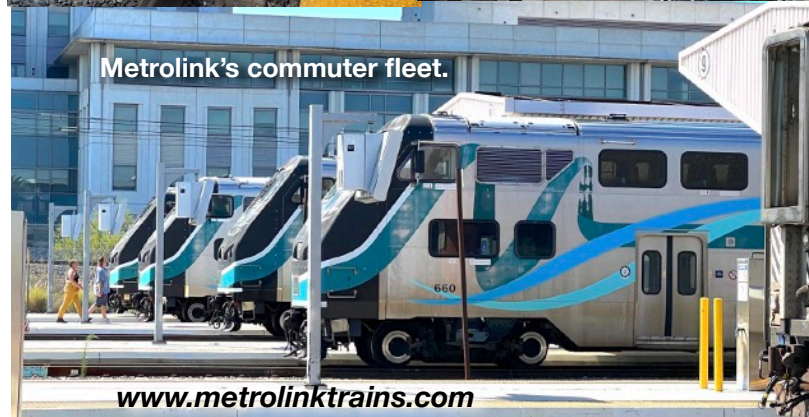
Metrolink's commuter fleet.