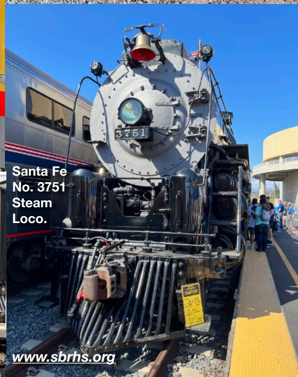
Santa Fe No. 3751 Steam Loco.