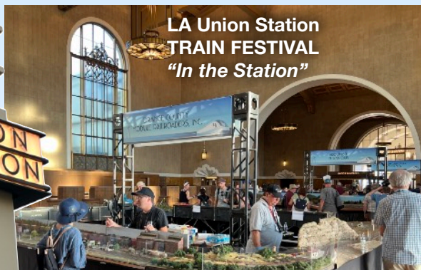
LA Union Station TRAIN FESTIVAL "In the Station"