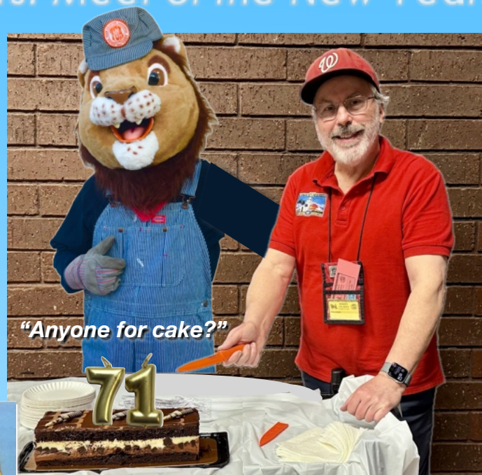
"Anyone for cake?"