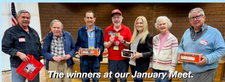
The winners at our January Meet.