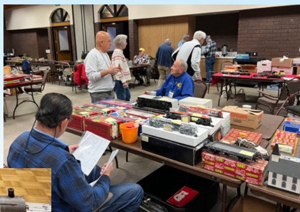
Plenty of trains for sale!