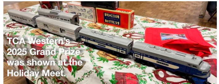
TCA Western's 2025 Grand Prize was shown at the Holiday Meet.

The Western Division Board of Directors has chosen the Grand Prize for 2025. It's the LIONEL 2244W passenger set from 1955 featuring a Wabash 2367 F3 "O" gauge, twin-motored locomotive, plus a matching 2367C trailer unit. It comes with a baggage car, dome & observation.