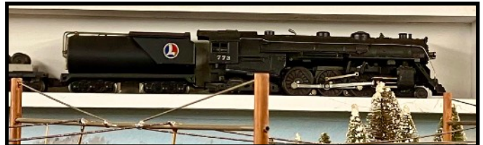
3) 1965 - 773 with 763T tender.