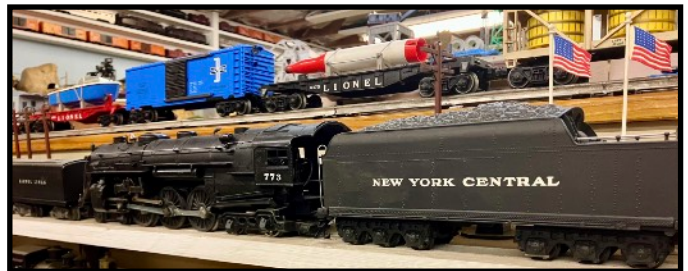
2) 1964 - 773 with white lettered 700T.