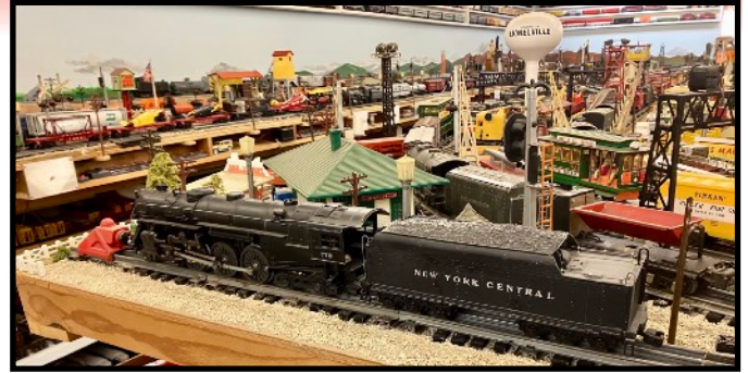
1) 1950 - 773 with silver lettered 700T.