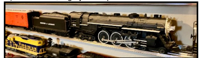
5) 1986 - 784; Boston & Albany, direct-sales only.