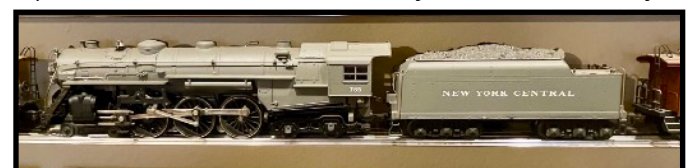
6) 1987 - 785; in gray, but not gun-metal. Too bad!