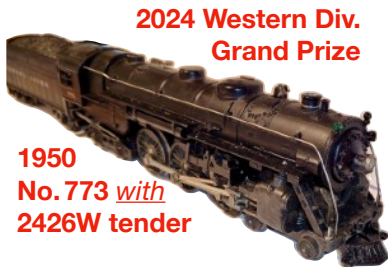
2024 Western Div. Grand Prize

I still came up with a list of 12, not counting the gold 100th Anniversary Hudson, which I consider a "display only" piece. I discovered that I only had 10 of the 12 in my collection, so began the Internet quest to add the missing two pieces. I'll tell you about the results in the next part of this article.