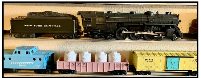
4) 1984 - 783; highly-anticipated in the market.