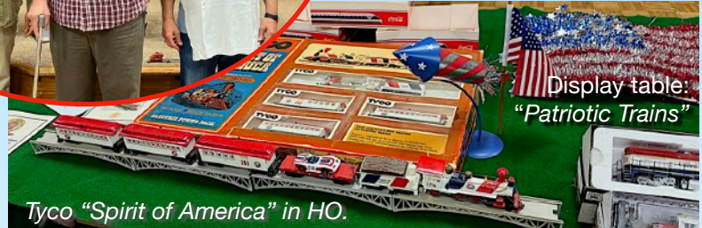
Display table: "Patriotic Trains"