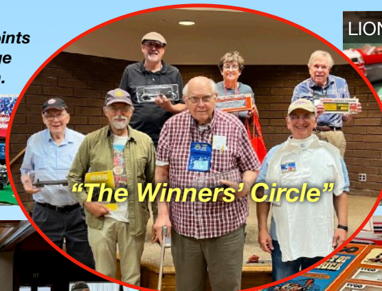
"The Winners' Circle"