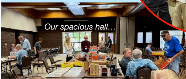
Our spacious hall...