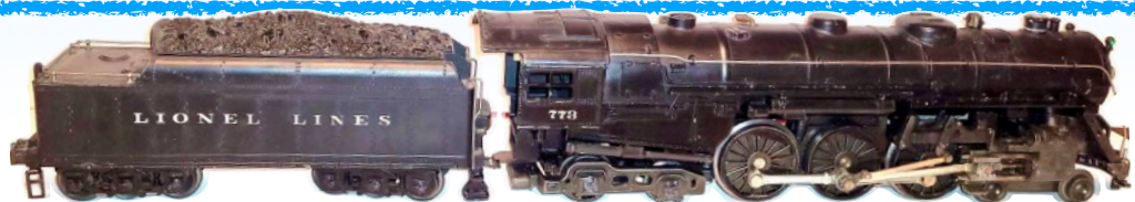
of the actual Grand Prize 773 Hudson.

T he TCA Western Grand Prize this year is a LIONEL No. 773 Hudson steam-type locomotive & tender from 1950. The prize will be awarded on December 21, 2024. (You need not be present to win.). Every $25 ticket you buy is eligible to win $100 at the meets all year long, but you must be present to claim your cash prize! Hint: enter early and often! To join TCA Western Division and TCA National, see page 4 (at the bottom), or sign up at the meet. You must be a member to enter!