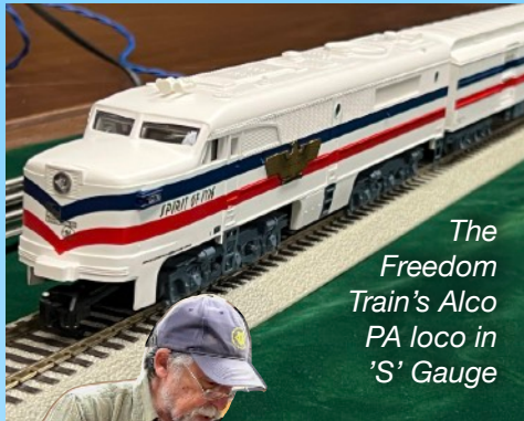
The Freedom Train's Alco PA loco in 'S' Gauge